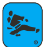
Flying Side Kick