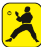
Knifehand Guarding Block